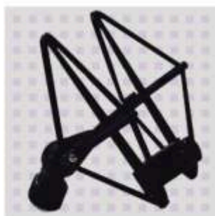
PSM elastic any position studio shockmount