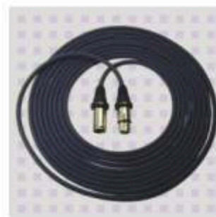
VMC-06 quad microphone cable (6 m)

In the interests of product development, the specifications, construction and appearance of all above products are subject to change without prior notice and without obligation to install these improvements in any product previously manufactured.