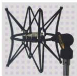
VSMD vintage style spider type studio shockmount