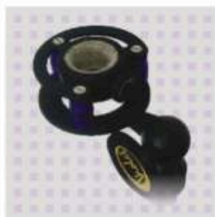
GSM compact vertical position studio shockmount